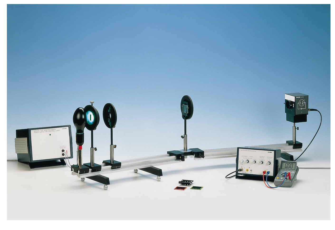
Fig. 1: Experimental set-up: Planck's "quantum of action" from the photoelectric effect (line separation by defraction grating).

By turning an arm of the optical bench, superimpose the coloured slit images successively on the entrance diaphragm and after several seconds determine the corresponding, stable voltage levels. To avoid having the UV fractions from second order diffraction falsify the measured values for the