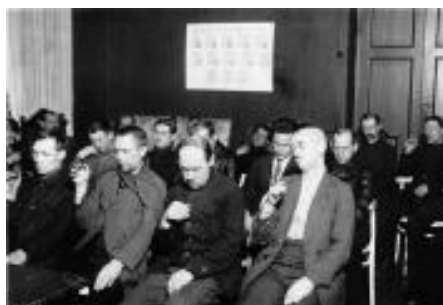
V. M. Bechterew working with hypnotized alcoholics