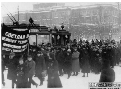
Urn containing the ashes of V. M. Bechterew and funeral procession accompanying the urn along the river Něva embankment